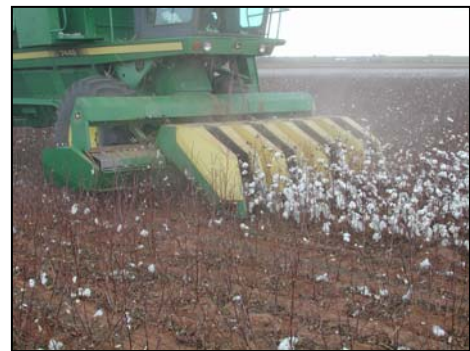
Fig. 1. Plot harvest in 2005. Cotton recovered from June 17 hail event.

Results: Total cotton lint yield within a zone was not affected by water distribution designs having FV's between 0.71 and 0.94. During the test period, conditions other than SDI design had a greater impact on the spatial yield variability than did the design treatments. Fig. 1 shows average cotton yields and emitter flow rates as a function of the distance from the SDI supply manifold in the 0.6 BI irrigation treatments. The POOR treatment was irrigated with small diameter drip tape, and resulted in reduced emitter flows away from the supply manifold as friction losses reduce pressures at the emitters (18% decrease in flow rate along lateral). Yields tended to follow the water, generally decreasing away from the supply manifold, but increasing at the distal location. The VGOOD treatment was irrigated with an optimum size drip tape that compensated for friction losses in the tape with the change in elevation along the length of the plot (2% increase in emitter flow along lateral). The ACC treatment used large diameter drip tape and low operating pressure resulting in larger emitter flows at locations farther from the supply manifold (15% increase along lateral). Yields of the ACC treatment were fairly level along the length of the plots showing only slight increases with distance away from the supply line in 2003 and 2004. In some instances, SDI installation costs could be reduced by relaxing design specifications.